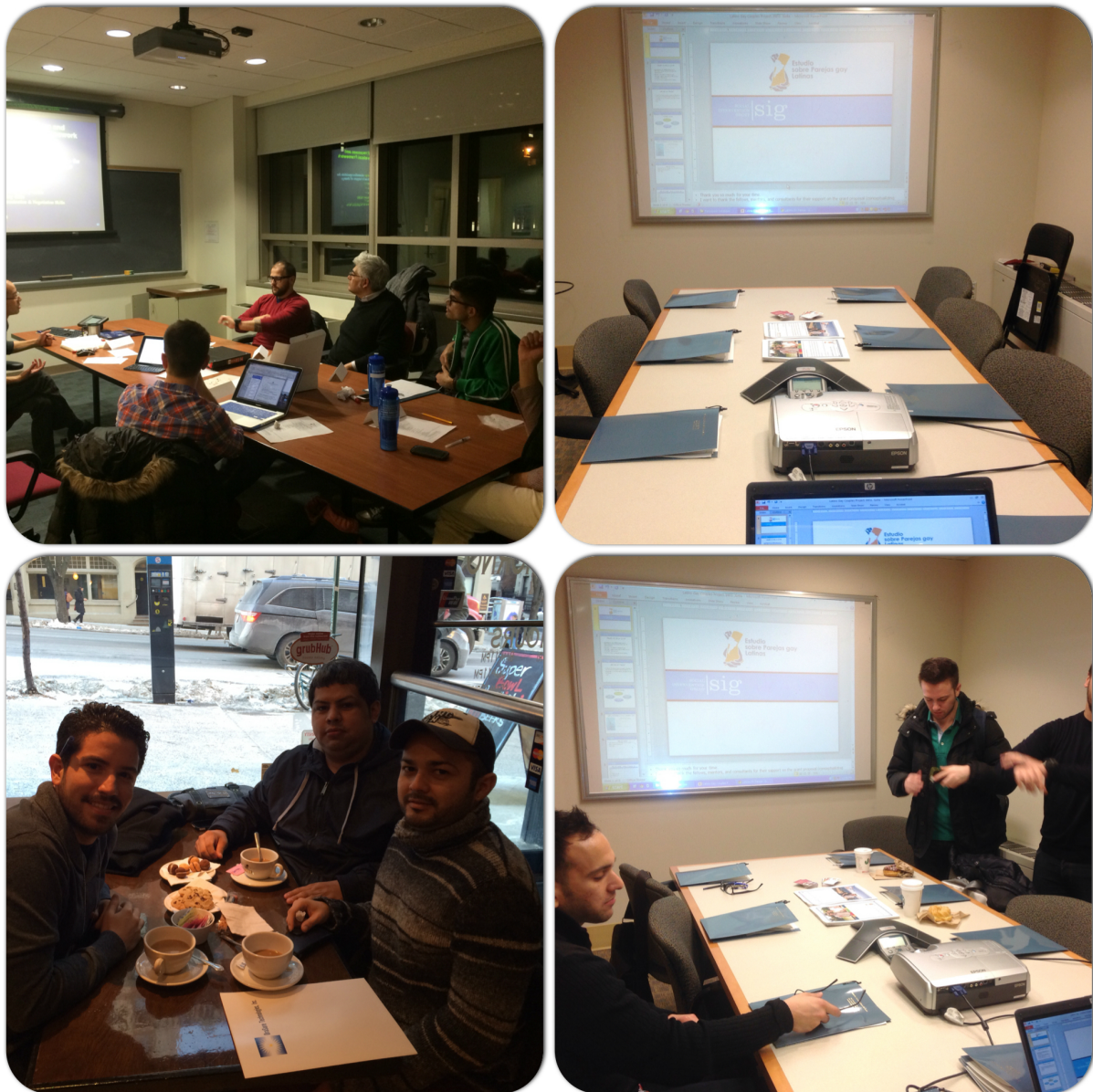
Figure 1. Collection of photos from a stakeholder meeting.

is further defined and discussed below in relation to our “Latinos en Pareja” study.