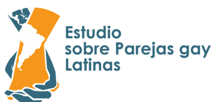
Figure 4. Latinos en Pareja logo.

and Jack’d. Our profile heading included the words “En pareja [In a relationship?]?” and a picture of a couple holding each other. The couple was part of our stakeholder team who consented in writing to use of the picture. Once potential participants clicked on the profile, they were directed to the following heading, “Proyecto sobre Latinos en Pareja [Latino gay couples study]”, and a brief description that included the following message, “Proyecto sobre latinos en pareja. Promoviendo relaciones saludables. Cada participante puede recibir hasta $120. Nos puede llamar ahora para determinar si es elegible [Latino gay couples study. Promoting healthy relationships. Each participant can receive up to $120. Call us to determine if you are eligible]”, plus a phone number and email address. Participants also had the option to access our Latinos en Pareja Facebook page, using the social network link built into the apps.