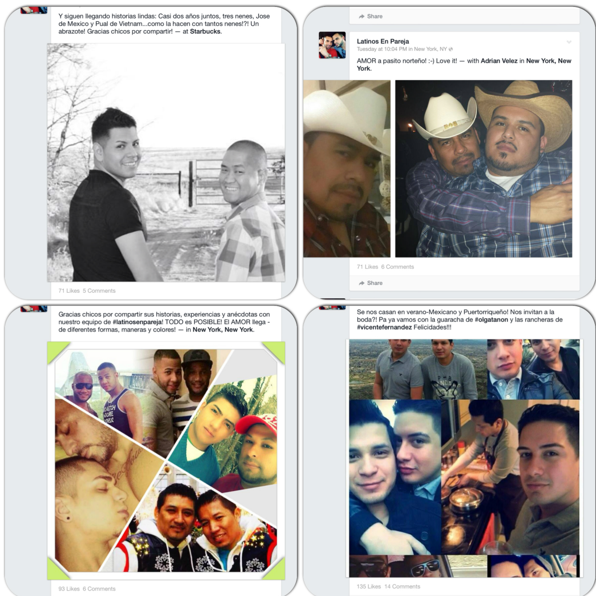
Figure 6. Collection of photos shared directly with the research team by Facebook users with their consent to use for study-related deliverables.

Our focused and targeted message about the study and the participants' positive perception of our study enabled us to increase recruitment and engage others through all of the social media venues we used. In addition, through the sharing of sexual health information, we enabled users to engage in thoughtful discussions about HIV, sexually transmitted infections (STIs), and sexual health promotion.