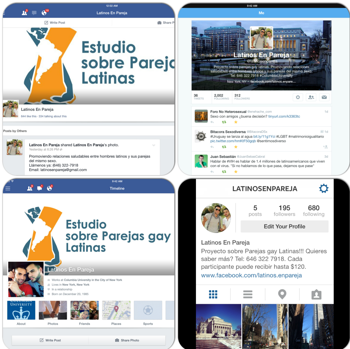
Figure 2. Collection of photos from our online social media sites.

Along with recruiting participants through social media platforms, research staff who were involved in the recruitment and the adaptation of the study focused on other channels to distribute recruitment materials including local barbershops visited by gay Latinos, community-based organizations and social venues, press releases and public service announcements published through local media, and the deployment of outreach recruiters in gay venues (eg, bars, bathhouses, community events, and local support groups aimed at gay men). We also shared on our social media sites information about these venues as well as the services they offered (Figure 3). However, although we reached more than 50 community-based organizations in New York City, most of the participants came from the Hispanic AIDS Forum, Betances Health Center, Latino Commission on AIDS, and Make the Road New York.